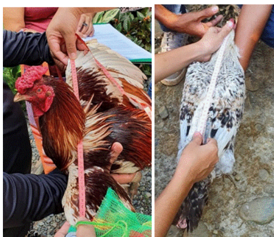
Figure 2. Measuring of wing span and body length of chicken done during the baseline survey.

The chicken's weight was obtained in kilograms. A tape measure was used to measure the body, which comprised the chickens' wingspan, chest circumference, body length, and shank length. To ensure accuracy and comparability across different birds, and to provide a consistent location for measurement, the chest circumference was measured around the pectus. The body measurement was taken with the neck fully extended, starting from the tip of the beak to the tip of the tail, excluding the feathers (Figure 2). The chicken's wingspan was obtained by fully stretching the wings and measuring across the back of the bird. To get the shank length, the hock joint to the spur of either leg was measured. Data related to the productivity traits, adaptation, and resilience, and the issues encountered in growing the Paraoakan chicken were collected through surveys and interviews.