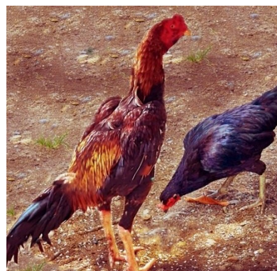
Figure 1. Male and female Paraoakan chickens.

Since the study considered Paraoakan chicken raisers as the actual population, purposive sampling was employed to select respondents. The selection was facilitated by barangay officials and representatives from the Department of Agriculture, particularly the heads and personnel of the Municipal Agriculture Offices. To obtain the phenotypic identification and body measurements, the study examined 96 pairs of 1-year-old male and female chickens randomly picked from each respondent's flock of Paraoakan chickens (Figure 1).