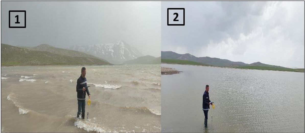
Figure 1. Sampling from the lakes Süphan (1) and Hıdırmenteş (2) in Van Lake Basin (Türkiye).