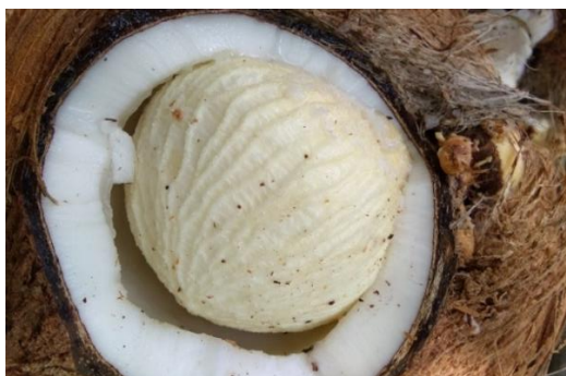
Figure 1. Coconut ( Cocos nucifera Linnaeus) embryo.

Coconut embryos (Figure 1) were collected from an authorized local coconut shop at Davao City, Philippines. The shop grows non-genetically modified coconuts in an organic method. Before collecting the embryos, all coconut fruits were submitted to a Botanist for taxonomic identification and verification of botanical specimen (Certificate #2019-00124). After verification, the samples were washed with 5% potassium permanganate solution and distilled water to disinfect and remove any debris (Ma et al. 2015). These were then ground into pulp using a house blender and placed in a 1,000 ml glass beaker. The ground sample was then subjected to acid hydrolysis.