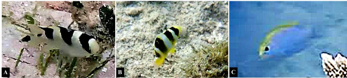
Figure 3. Underwater photographs of three potential new records of damselfishes in Palawan. A) Amblypomacentrus clarus Allen & Adrim, 2000; B) Dischistodus darwiniensis (Whitley, 1928); and C) Pomacentrus aurifrons Allen, 2004.