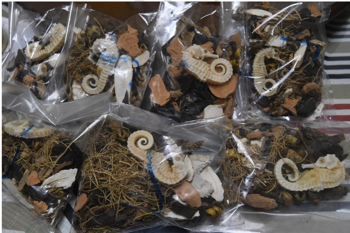
Figure 3. Dried seahorses in the TCM trade in Manila City.

Seahorse poaching and trafficking continue to threaten the survival of seahorses in the Philippines despite these national and international protections (Pollom et al. 2020). Although it is challenging to ascertain seahorse population decline due to limited population studies, previous surveys and interviews with people involved in the trade chain in the Philippines indicated up to 70% decline in catch rate from 1985–1995 (Pajaro and Vincent 2015). The persistent high demand for seahorses for TCM from the Philippines (Figure 3) and abroad could be a major factor driving the perceived or actual population decline.